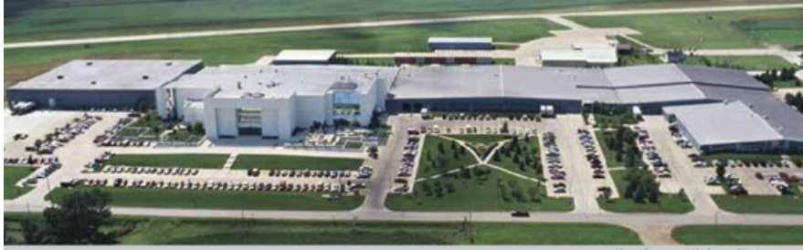
Above: Our property in Orange City, Iowa