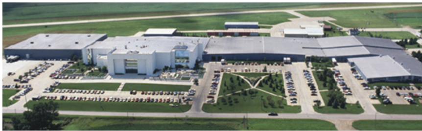
Above: Our property in Orange City, Iowa